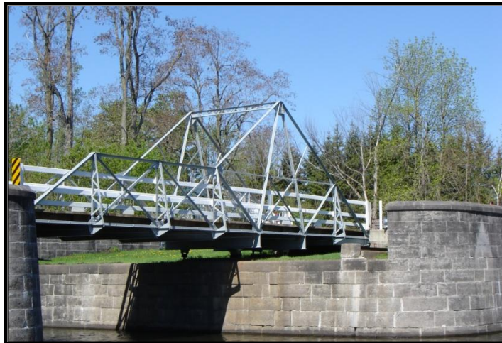
The Swing Bridge at Burritt's Rapids