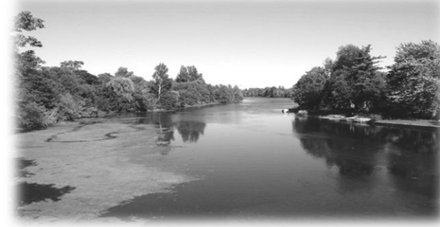
Downriver view from bridge