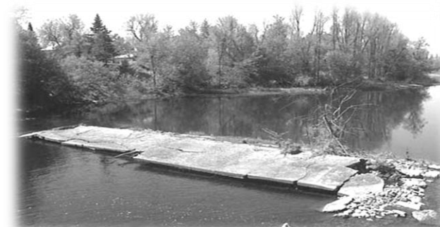
*Burritt's Rapids Dam