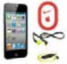
Ipod Touch (8GB) + Nike Sport Kit

Complete our online survey by March 15, 2011 and you will automatically be entered for a chance to win one of these great prizes: